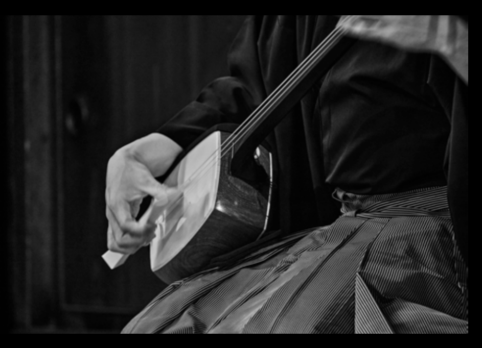
These children practice with the professional and are inspired by the technique. It is a special time that bonds the feelings of all for the festival music.